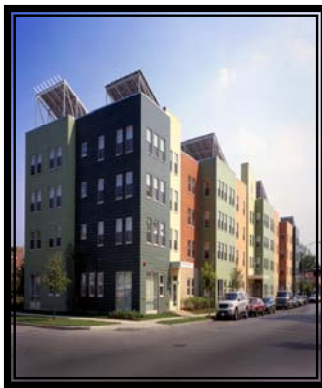
Wentworth Commons by Harley Ellis Devereaux

Rents will be kept at 60 percent of the area median income for 10 years. The developer is hoping to expand the venture into other city neighborhoods soon.