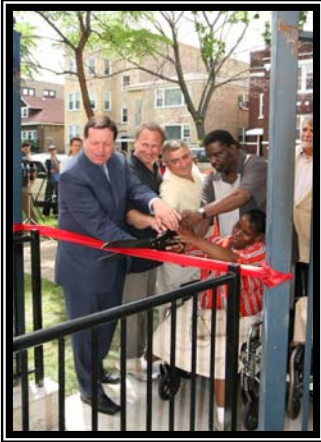
Ribbon Cutting in Rogers Park