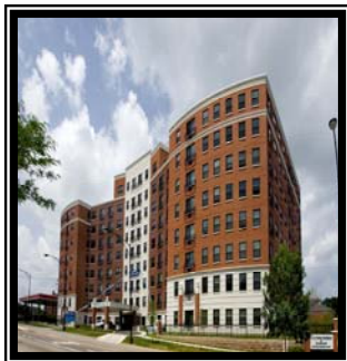
Senior Residences at Ravenswood

Wentworth Commons was funded through the Housing Tax Credit Program, Federal Home Loan Bank, HUD SHP, DCEO and the Illinois Clean Energy Community Foundation.